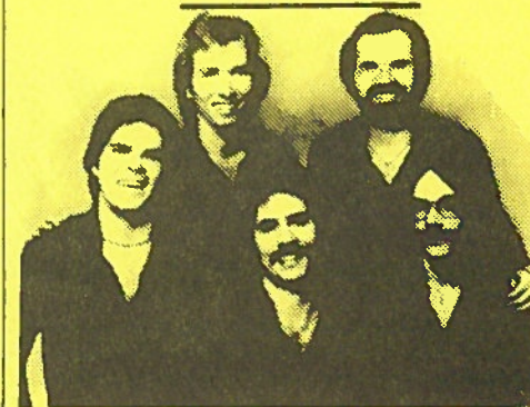
THE KILLER ORCHESTRA