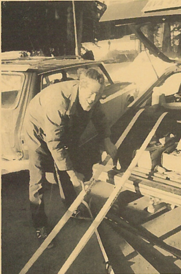
Before the Great Race: Application of the Secret Sauce