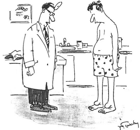
"The knees are the first thing to go."