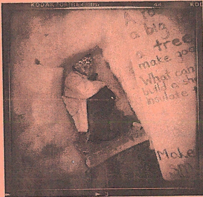
Build the masses an igloo and the people will come. A "winter aware" fourth-grader at Kings Beach Elementary School.