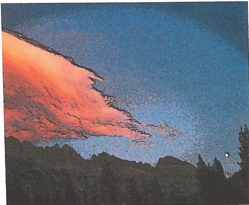
Moonrise, northern Yosemite, October 14, 2005.